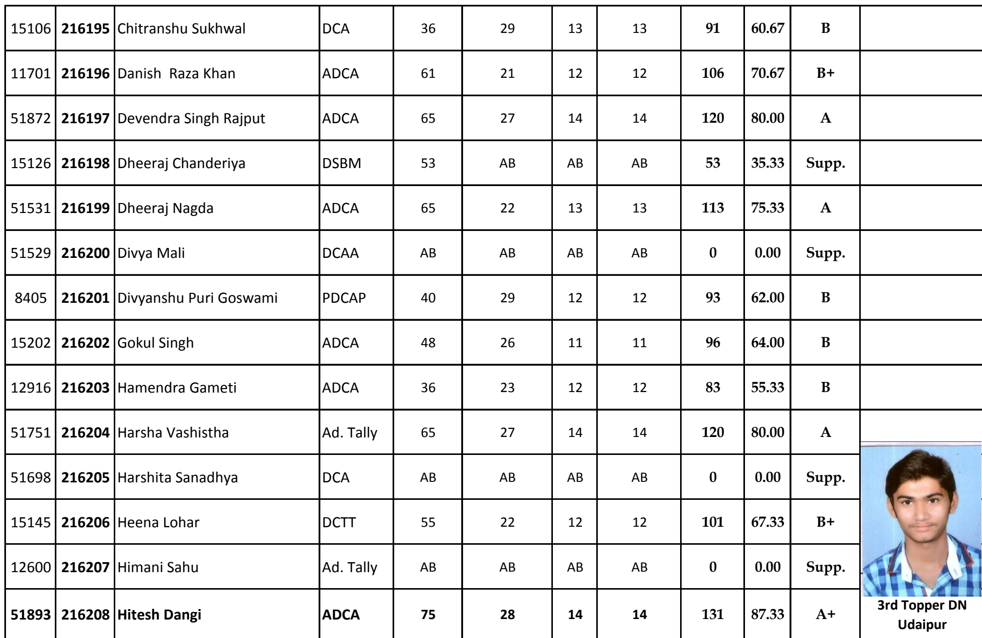
3rd Topper DN Udaipur